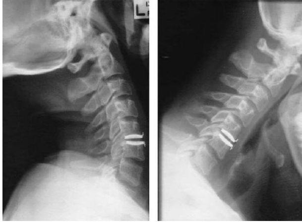
FIGURE 3. Lateral flexion/extension x-rays after placement of a C5–C6 artificial disc prosthesis from case 2. Note that normal movement occurs at the instrumented level, as demonstrated by the crowding, then splaying of the C5 and C6 spinous process.

postoperatively, despite adequate decompression, suggesting this was due to myelomalacia or gliosis rather than edema.