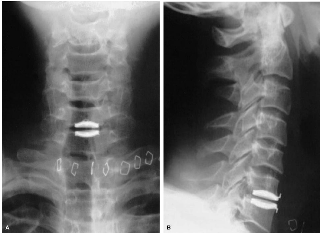
FIGURE 2. Postoperative anteroposterior (A) and lateral (B) x-rays after placement of an artificial disc prosthesis at the C6-C7 level in case 3. The prosthesis is centered on the disc space. Minimal change in disc height occurs compared with preoperative films.

ures 3 and 4. The titanium shells did produce artifact on MRI, making the adjacent spinal canal difficult to assess. This occurred in only two of seven patients, but subsequent CT scanning was able to confirm adequate decompression. High signal change in the spinal cord demonstrated on preoperative MR scanning was persistent